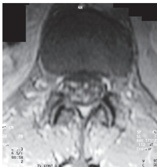
Fig. 2 – Transverse T1-weighted gadolinium-enhanced MRI scan at the L1-2 level. Enhancement of the cauda equina fibers in the thecal sac is seen

The tumor cells could reach the leptomeninges by several mechanisms: Arterial route (in patients with disseminated cancer, the leptomeninges are infiltrated through arachnoid vessels or choroid plexus); direct extension of the leptomeninges or seeding (primary CNS tumors), growing around and along peripheral nerves to the subarachnoid space (systemic tumors), iatrogenic (seeding of subarachnoid space during surgical extirpation of intraparenchymal metastases), entry to the subarachnoid space through the venous plexus of Batson and perivenous spread from adjacent bone marrow metastases. In most cases of breast or lung cancer pure leptomeningeal carcinomatosis is the result of cancer propagation from vertebral or paravertebral metastases 1-4,9 . New metastatic deposits along meningeal surfaces which invade subpial parenchyma, penetrate spinal nerve roots, and produce masses in the subarachnoid space.