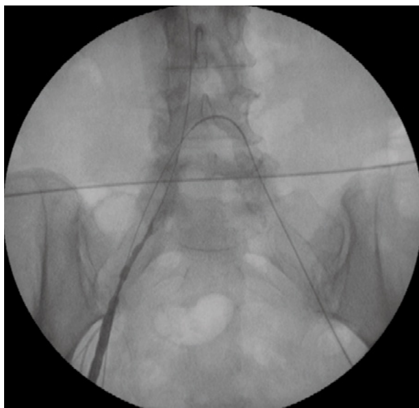
| FIGURE 3 | Non-occlusive thrombus on external iliac artery

▶ Aortography revealed non-occlusive thrombus on EIA | FIGURE 3 |, which was managed by CIA and