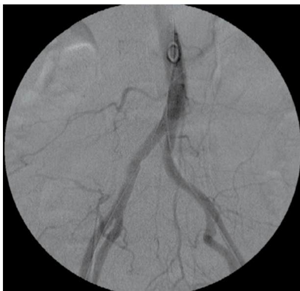
| FIGURE 4 | Final control after iliac artery angioplasty and arteriovenous exclusion with covered stent Hemobahn®

EIA balloon angioplasty (8x40mm and 5x10mm balloon, respectively, under 11F introducer). AVF exclusion was reached after releasing a covered stent (Hemobahn® 9x50mm) in right CIA.