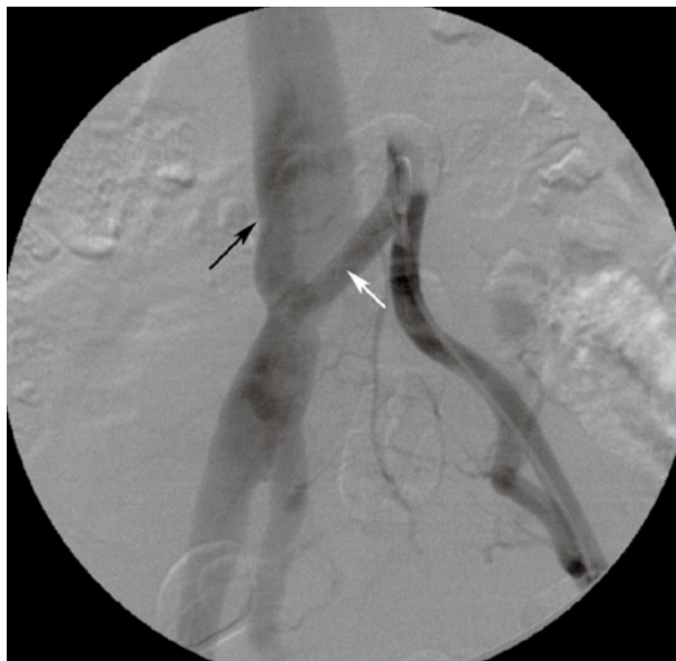
| FIGURE 1 | Ilio-cava fistula and right external iliac artery occlusion. White arrow – right common iliac artery | Black arrow – vena cava